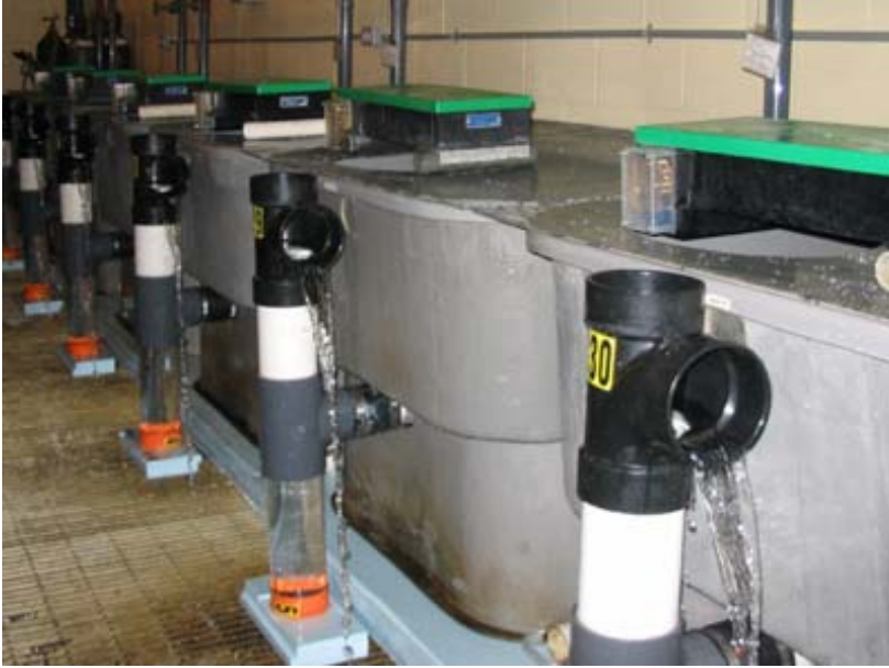
Figure 1: Rearing tank set-up with overflow and fecal collection vessels.