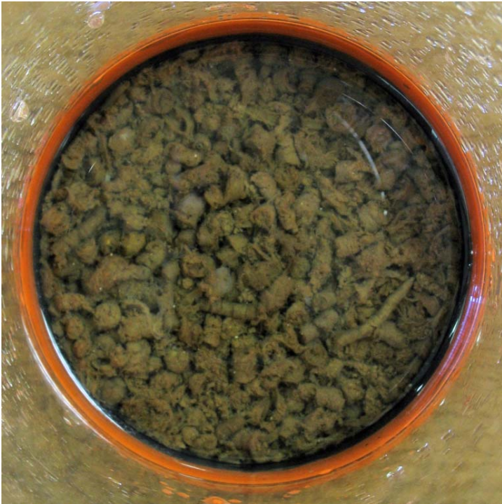
Figure 2. Close-up of fecal collection vessel showing intact, and undisturbed fecal particles.